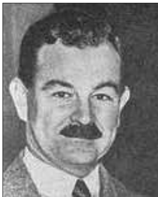
Brigadier Claude Nicholson.

On the morning of the 24th May the German 10th Armoured Division which had been bombarding the town from the high ground to the South and West launched their attack but failed to break through. The Brigadier, having been informed that the fighting troops would be evacuated the following morning withdrew his troops further into the town. Further instructions then reached him to continue the defence of the town in accordance with the wishes of the French area commander.